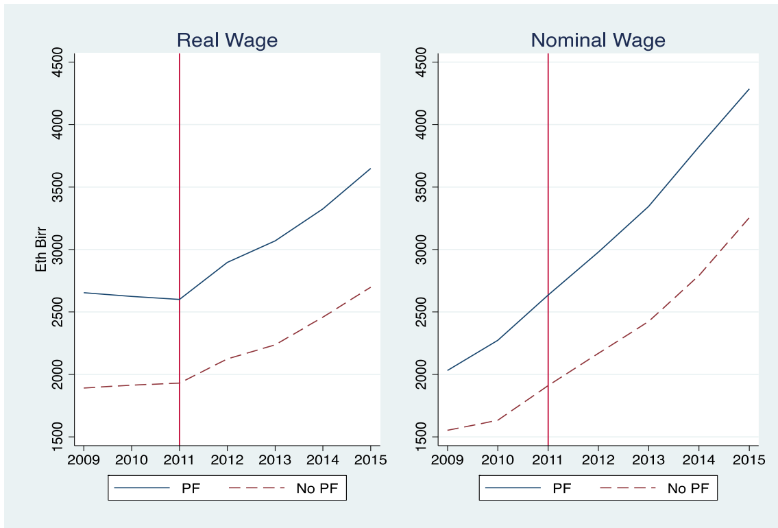
Figure 1: Mean wages at manufacturing firms with and without provident funds.